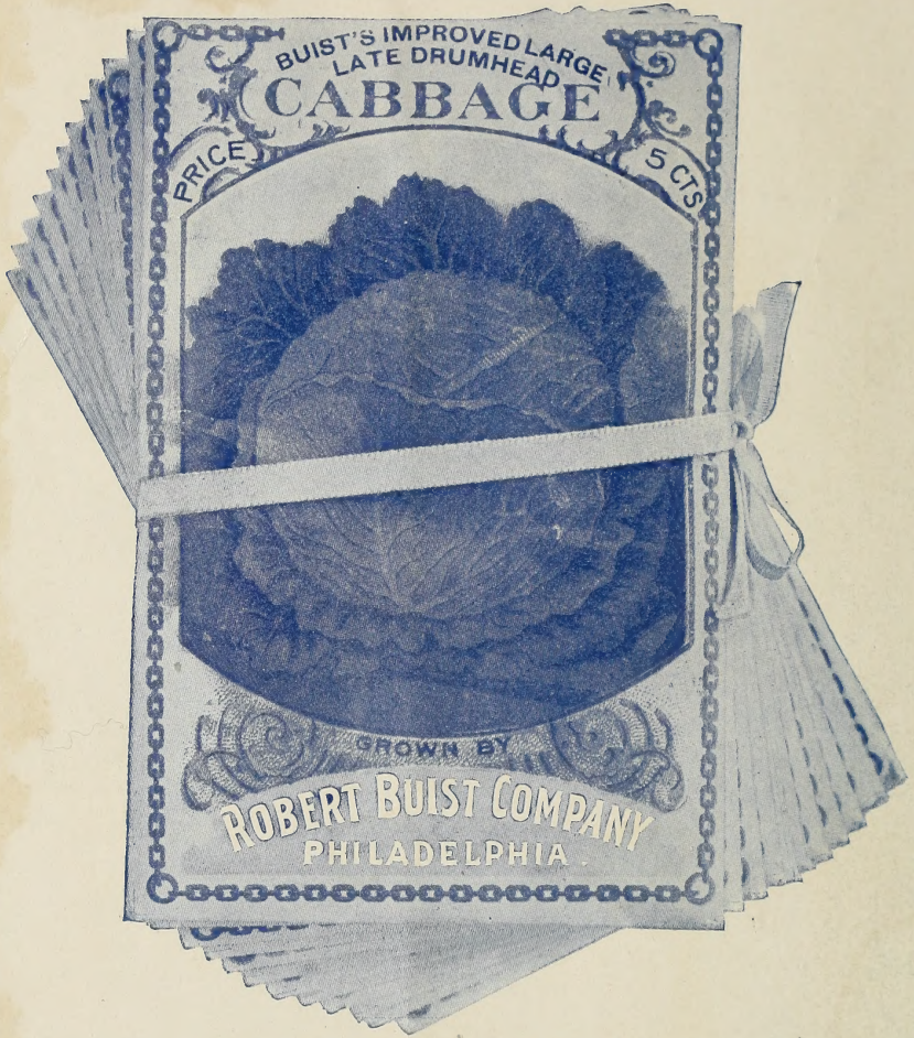
Illustration of Buist's Pictorial Brand Packets.

The best evidence of their Quality is the great demand for them